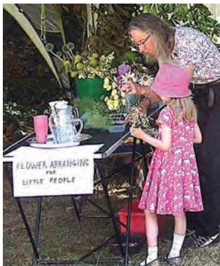
Flower Arranging for Little People

The local group CAMUS gave a resounding folk music evening in May that filled the church and used its wonderful acoustics to great effect.