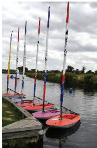
Rigged and Ready

The Sailing Programme has been in full swing this summer and while the dinghy racing has continued on the club grounds, the cruisers and half-deckers have been further afield having a race down river from Ely to the Ship Inn at Brandon Creek. Staying overnight on their boats and returning the following day they had a good turnout and the sailing was excellent with strong winds. The Wednesday evening leisure sailing has also been enjoyed. Starting early evening and finishing around 8 o'clock with a relaxed BBQ, chat and a beer, members have appreciated being on the river in the cool of the evening.