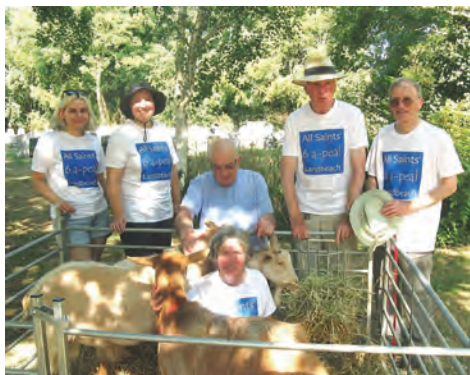
6 a-peal at the Garden Party

activities, books and bric-a-brac; as well as teas in the churchyard; and visiting goats and a donkey!