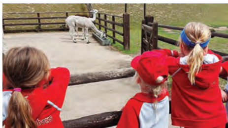
Rainbows at Shepreth Wildlife Park

Our Brownies and Guides shared a fun evening together at the Cambridge Footgolf in Milton, whilst the Waterbeach Rainbows enjoyed an exciting Cambridgeshire East county take-over day for Rainbows at Shepreth Wildlife Park. The Rainbows also experienced a visit to Denny Abbey before they finished for the summer holidays.