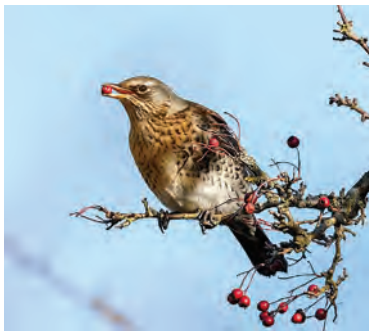
Fieldfare

Look out for migrant birds arriving to spend the winter at Wicken Fen next time you are visiting the reserve. By the time you read this article, you should be able to spot wigeon, redwing and fieldfare. The low rays of autumn sun catch the reeds' feathery golden spikes on afternoon walks round the boardwalk and in the reedbeds on the wider reserve. The changing seasons always present something new in the natural world, so if you haven't visited for a while, it's well worth making time for a stroll on the reserve.