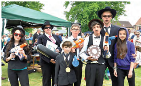
'Gangsters' by Pieces Terrace - 2013

If you have any old photos you would like to share then please send us a copy. Next year the theme will be "Something beginning with O..." so get those thinking caps working.