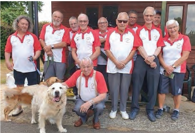
The team before a recent game with supporters at the front

Enough of this negativity. The fact is we have enjoyed our games and achieved some excellent wins. In the mixed triples and pairs as well as the men's pairs we have finished mid table in all the leagues. It was our first year in the mixed pairs and we have been pleased that all our lady members could take part and that a satisfactory position in the league has been achieved. It is also good that we welcomed three male members who have never played lawn bowls before. But they joined with enthusiasm and all reached the stage where they could play in the various leagues, which is very encouraging. In