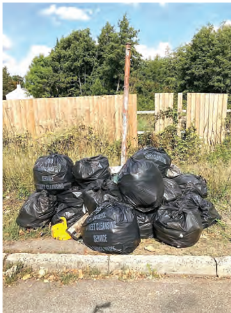
Recent haul from Wombling along Car Dyke Road