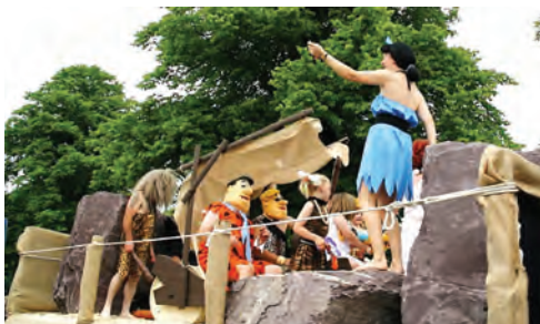
'The Flintstones' by Bannold - 2006

juniors and is not just for WCA groups, it is open for anyone to join in, streets or family groups are welcomed, and we would encourage you to join in. One suggestion was to show some photographs from old parades to give a flavour of how they used to be run, so here are some old parade photos: